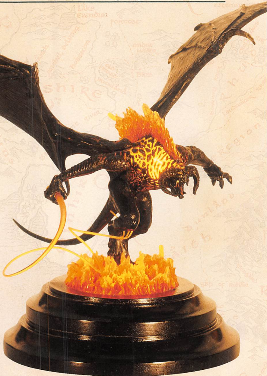
Daren Parrwood's Balrog in all its illuminated glory

"The only part of the model that was built from scratch was the whip, and that was a simple piece of clear resin, coloured in exactly the same manner as the main body of the Balrog.