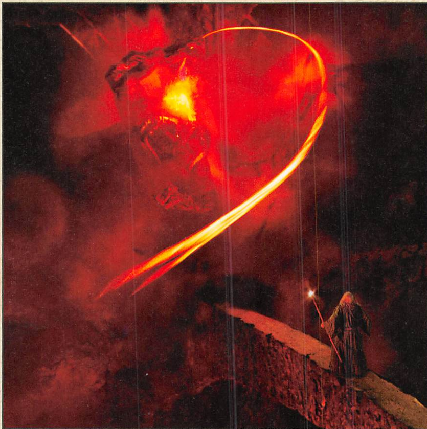
"I am a servant of the Secret Fire, wielder of the flame of Arnor."