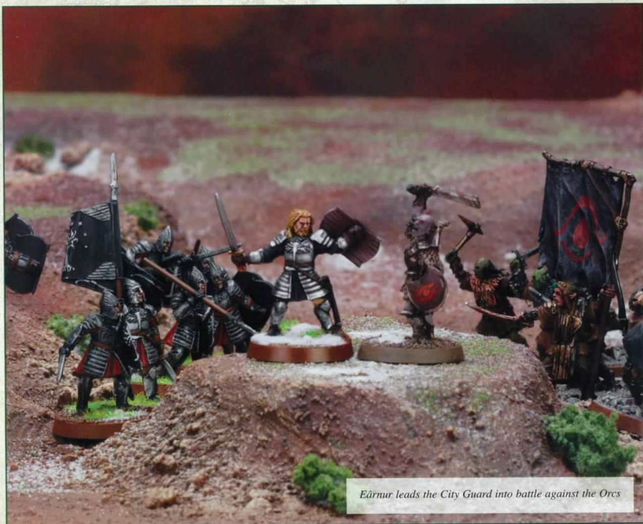
Eärnur leads the City Guard into battle against the Orcs