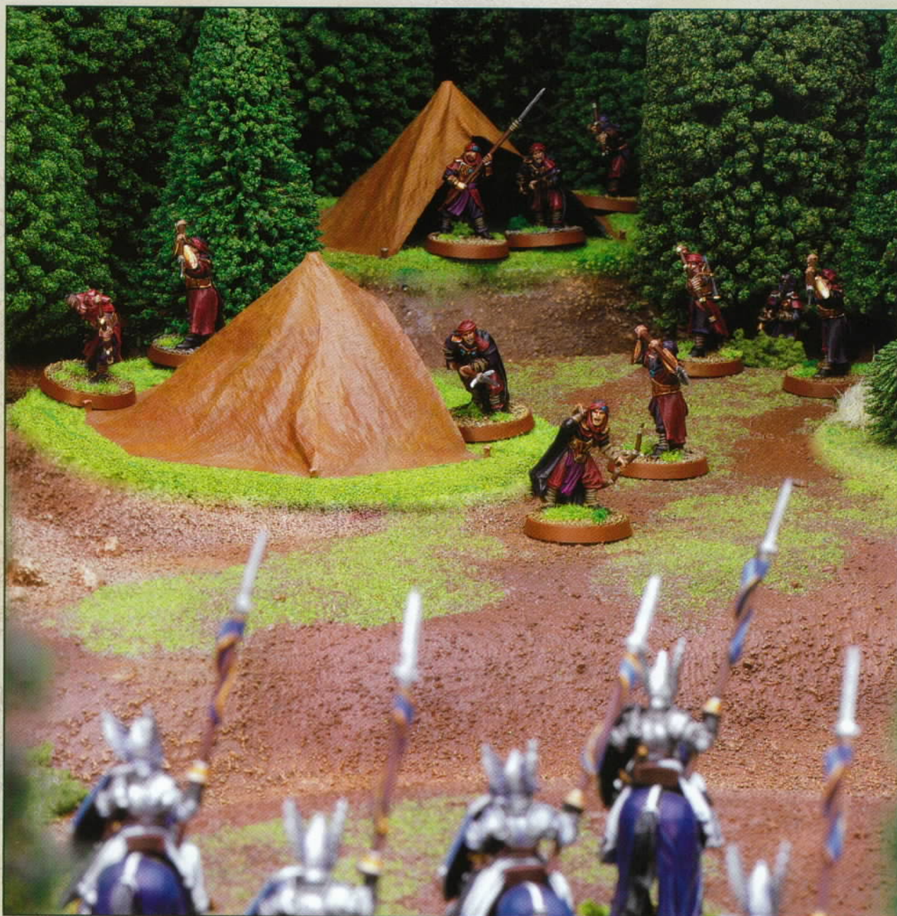
The Corsairs manage to raise the alarm as the Knights of Dol Amroth approach.

player may roll a D6 for each model that has not yet entered play. On the 2nd turn, models become available for use on rolls of 6 and should be placed touching their starting tent. On the 3rd turn, models not yet in play may enter on a 5+; on the 4th turn, a 4+; and so on. A roll of 1 always fails. Players should make a note of which models have entered play and which are still waiting to do so. Models that enter play in this manner may move and shoot as normal; however, they may not charge enemy models.