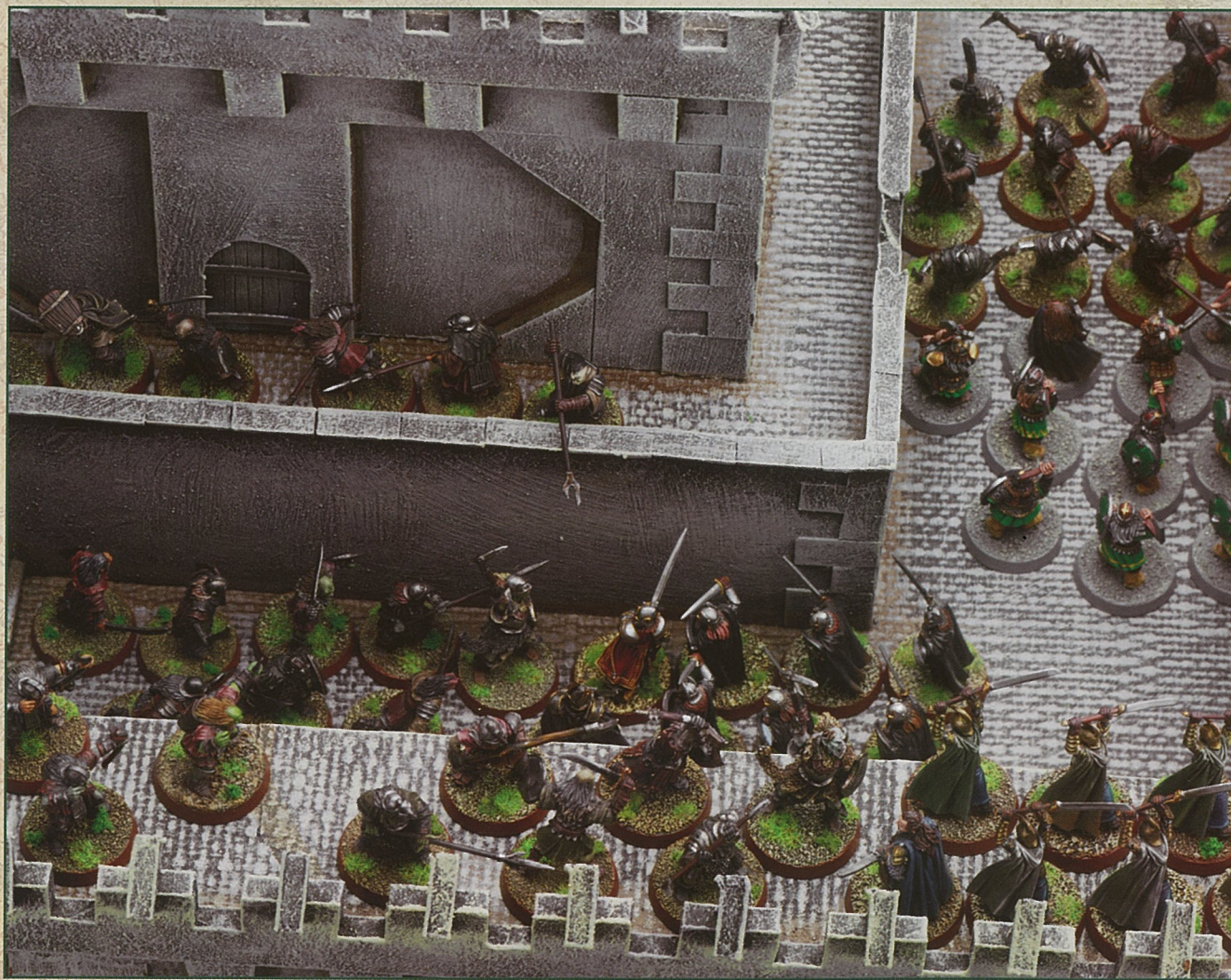
The forces of Good storm Barad-dûr

If you want to play this game with other forces, choose a Good force of up to 1,200 points and an Evil force of up to 600 points. Each side must include at least one Hero. The Good force may include a single Battering Ram and one ladder for every 10 models (rounding up) in the force. Neither side may equip more than 33% of its models with bows.