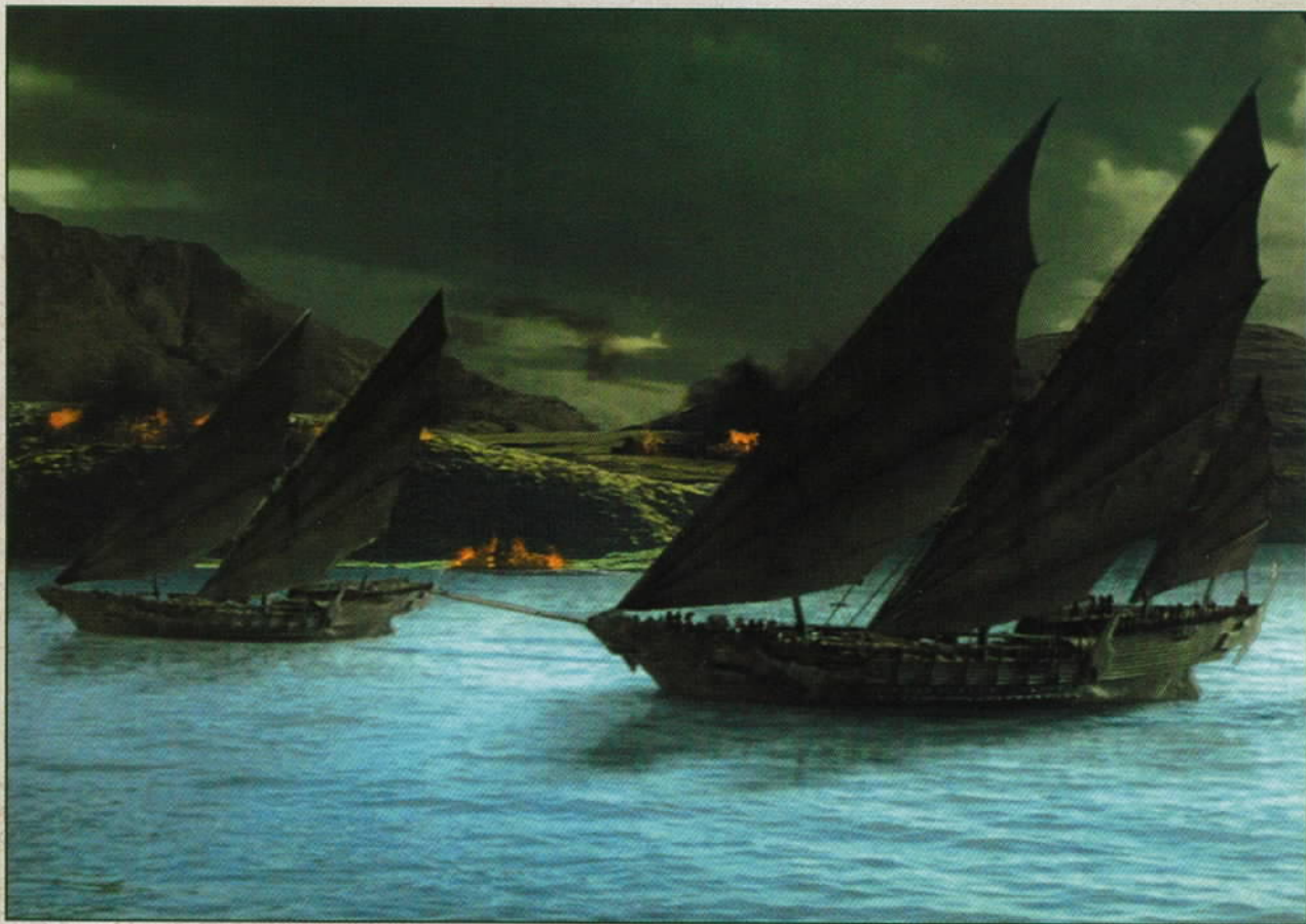
For boats of this size, use the rules for ships published in WD297.

there are four or more models propelling the boat; if there are fewer than four models, then the speed of the boat is halved. Note that boats are not affected by Heroic Moves.