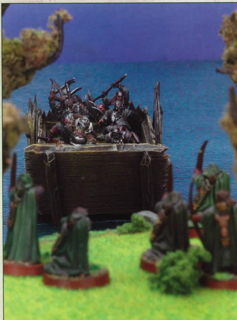
Rangers of Gondor attempt to repel an Orc raid.

Boats move in the controlling player's Move Phase. Boats may be turned to face any direction at the start of their move – they may not turn later in their move. Roll on the Handling Chart to determine how far the boat can move. The boat can move at full speed if